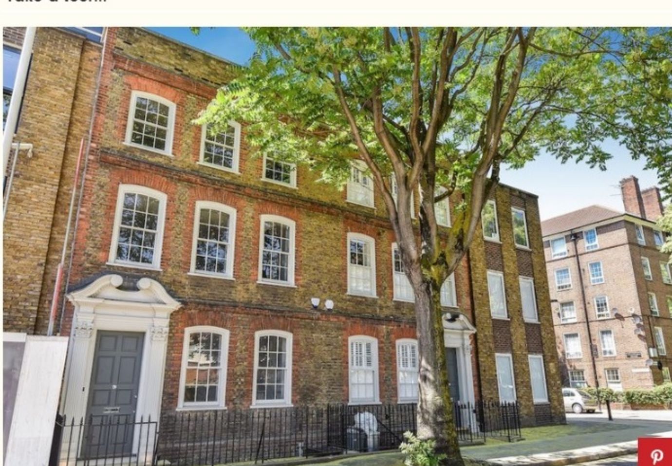
ACORN & GALLIARD HOMES