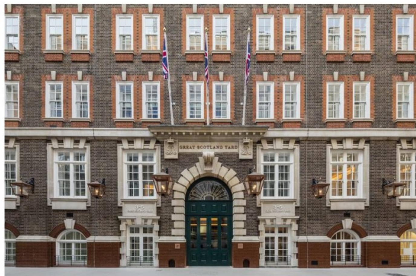
OUTSIDE GREAT SCOTLAND YARD, ST. JAMES'S

Great Scotland Yard, the former home of the British Metropolitan Police, has been developed into a luxury five-star hotel. You can stay in the building – often featured in the work of Charles Dickens and Sir Arthur Conan Doyle – for what is expected to be a £10,000 a night.