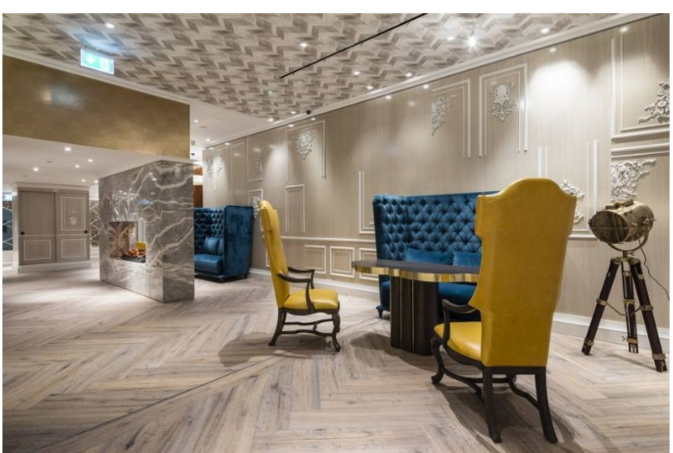
INSIDE GREAT SCOTLAND YARD

The hotel is due to open this year and will be operated by Hyatt, the American hotels group.