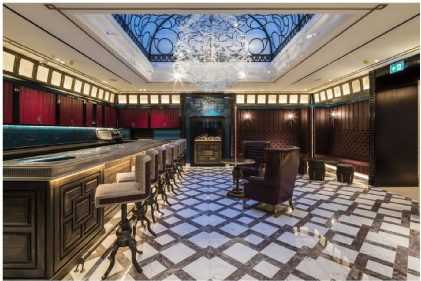
THE HOTEL'S SECRET WHISKY BAR

The luxury hotel that is steeped in British policial history will include references to the famous criminals of time gone by. In a secret whisky bar, a decadent chandelier made of glass shards will be a nod to the Forty Elephants, a 19th century gang of women known for smashing shop windows to steal jewellery. There will also be artwork by prisoners and old military uniforms.