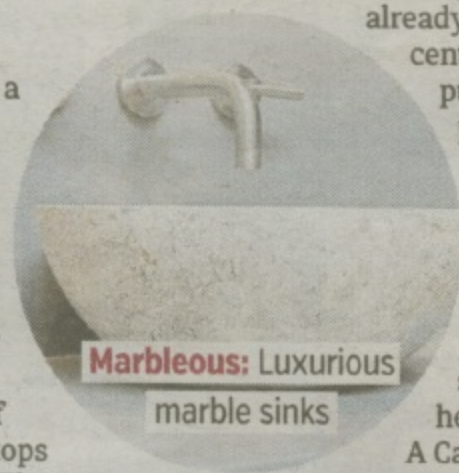
Marbleous: Luxurious marble sinks